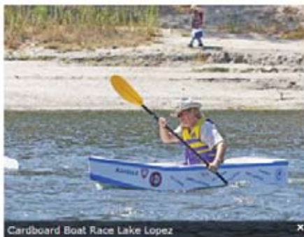
Cardboard Boat Race Lake Lopez